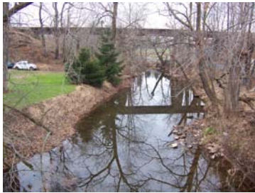
Site #TN3: Third Neshanic River at Route 202 crossing; AMNET #AN0332