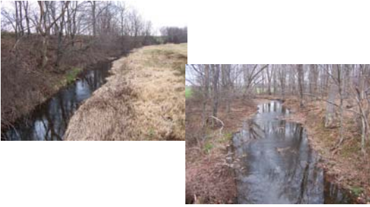
Site #TN1: Third Neshanic River at Route 579 crossing