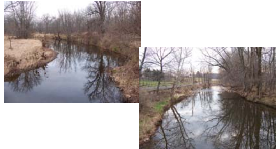
Site #N1: Neshanic River mainstem at Everitts Road and Reaville Road; AMNET #AN0333; USGS #01398000