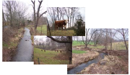
Site #TN2: Third Neshanic River at Dunkard Church Road and Route 579