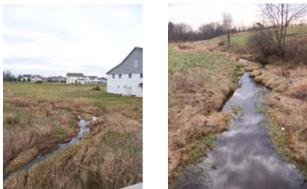
Site #UNT1: Unnamed Tributary at Route 514 crossing